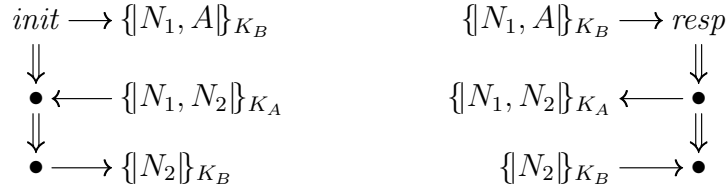
Figure 3.1: Needham-Schroeder Initiator and Responder Roles